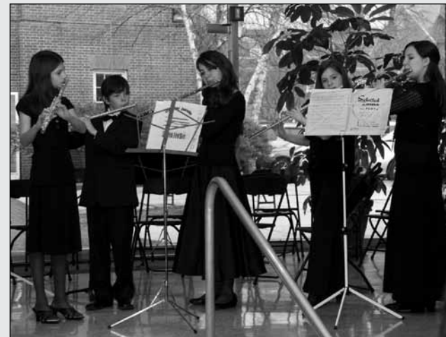
Flute ensemble entertains at Gala.